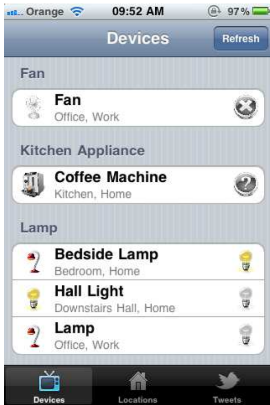
Fig. 2. iPhone Application

and ease of interpretation by the system. An example of the success that can be achieved combining these techniques is found in CAMP [21], which uses a magnetic poetry metaphor and allows users to visually piece together snippets of natural language to make simple rules for a video capture and access system.