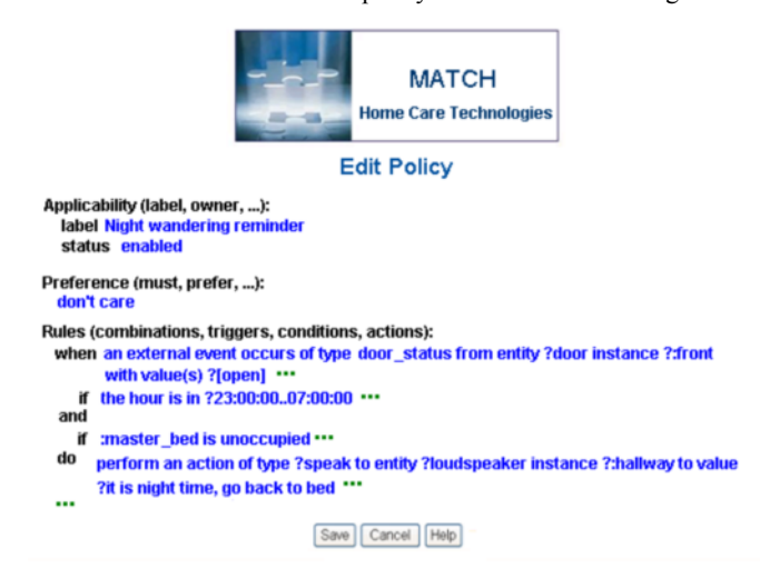
Figure 2. The Web-Based Policy Wizard

A screenshot of the web-based policy wizard is shown in Figure 2.