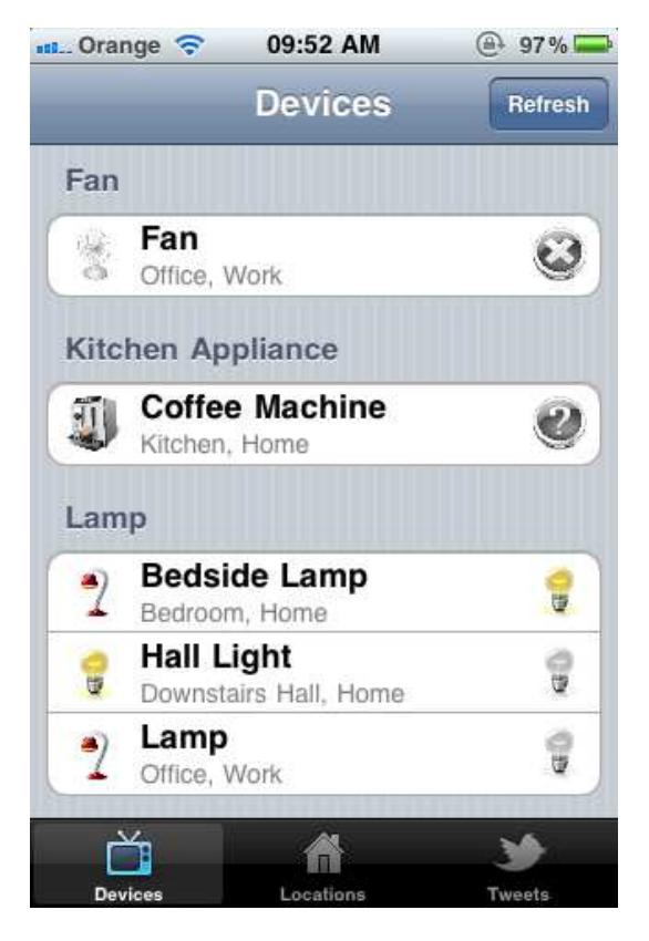
Fig. 2. iPhone Application

and ease of interpretation by the system. An example of the success that can be achieved combining these techniques is found in CAMP [21], which uses a magnetic poetry metaphor and allows users to visually piece together snippets of natural language to make simple rules for a video capture and access system.